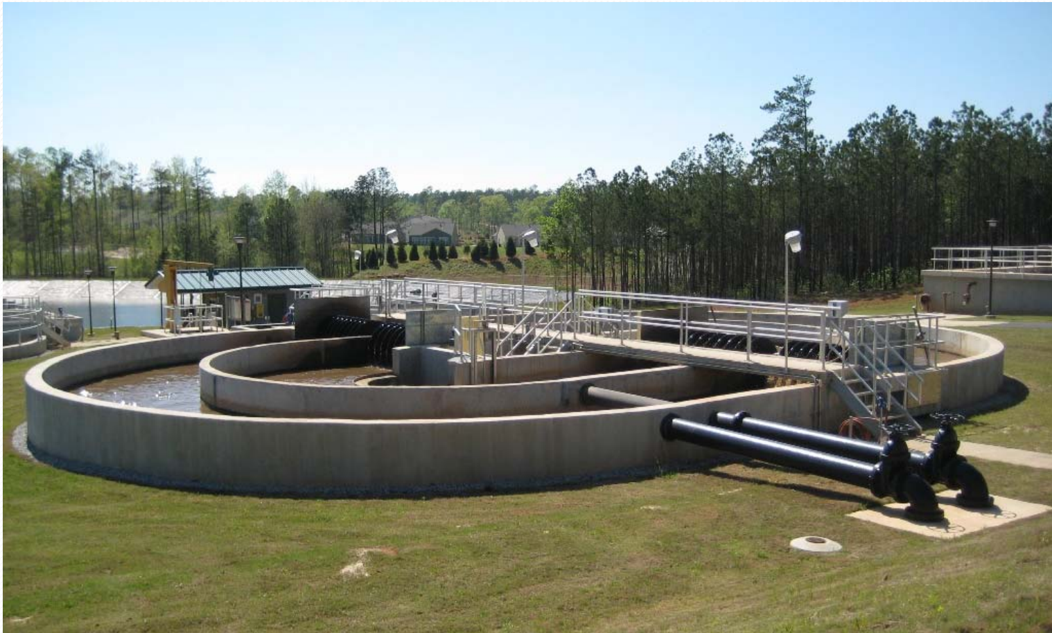
Orbal Oxidation Ditch. The Sun City Peachtree Golf Course and Single Family Homes are in the background