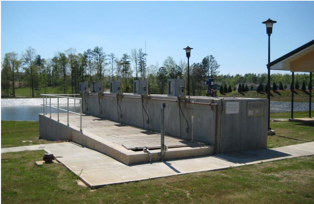
DynaSand Filters with Reject Pond in background