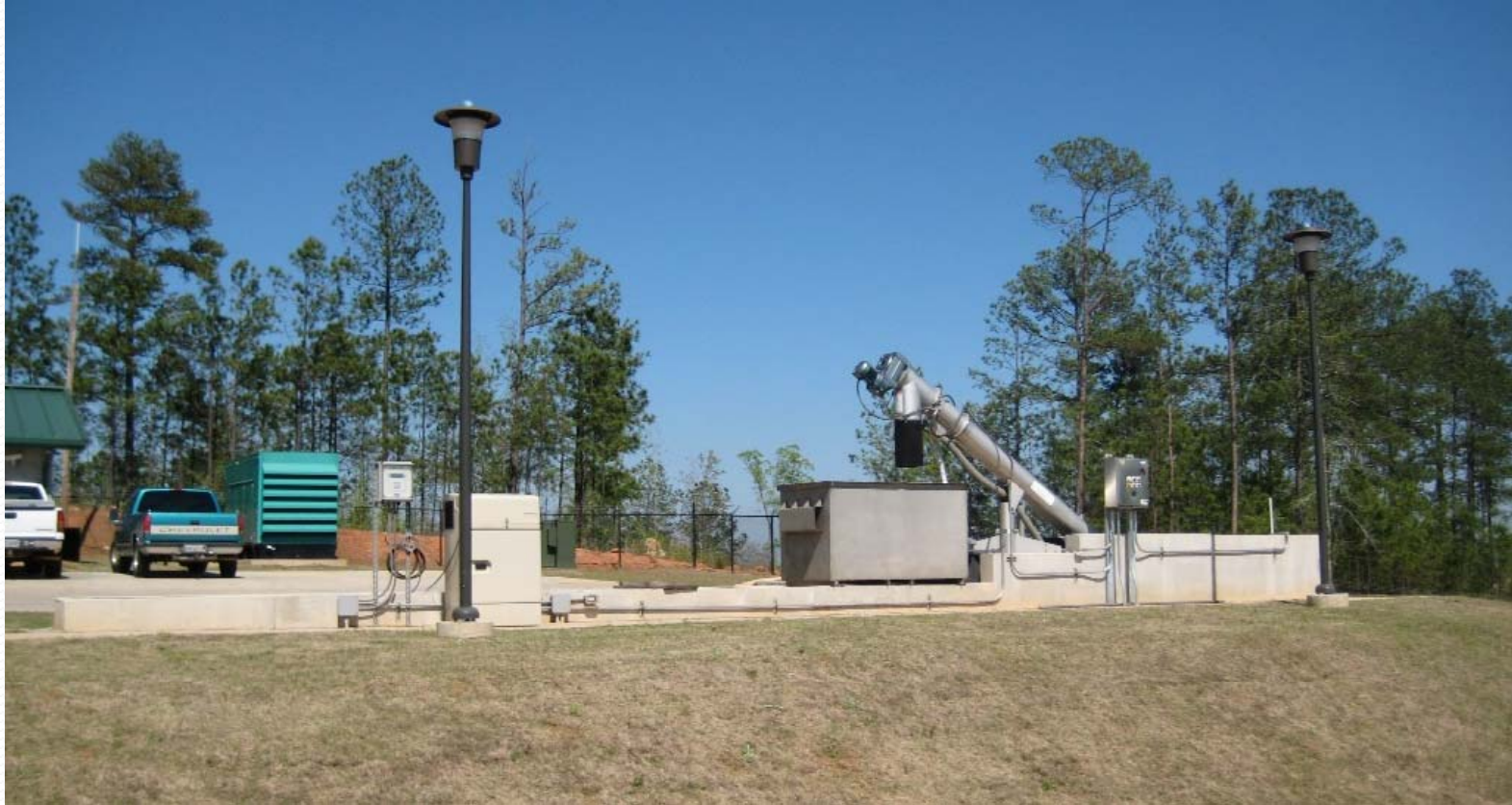
Helisieve Spiral Screening Unit