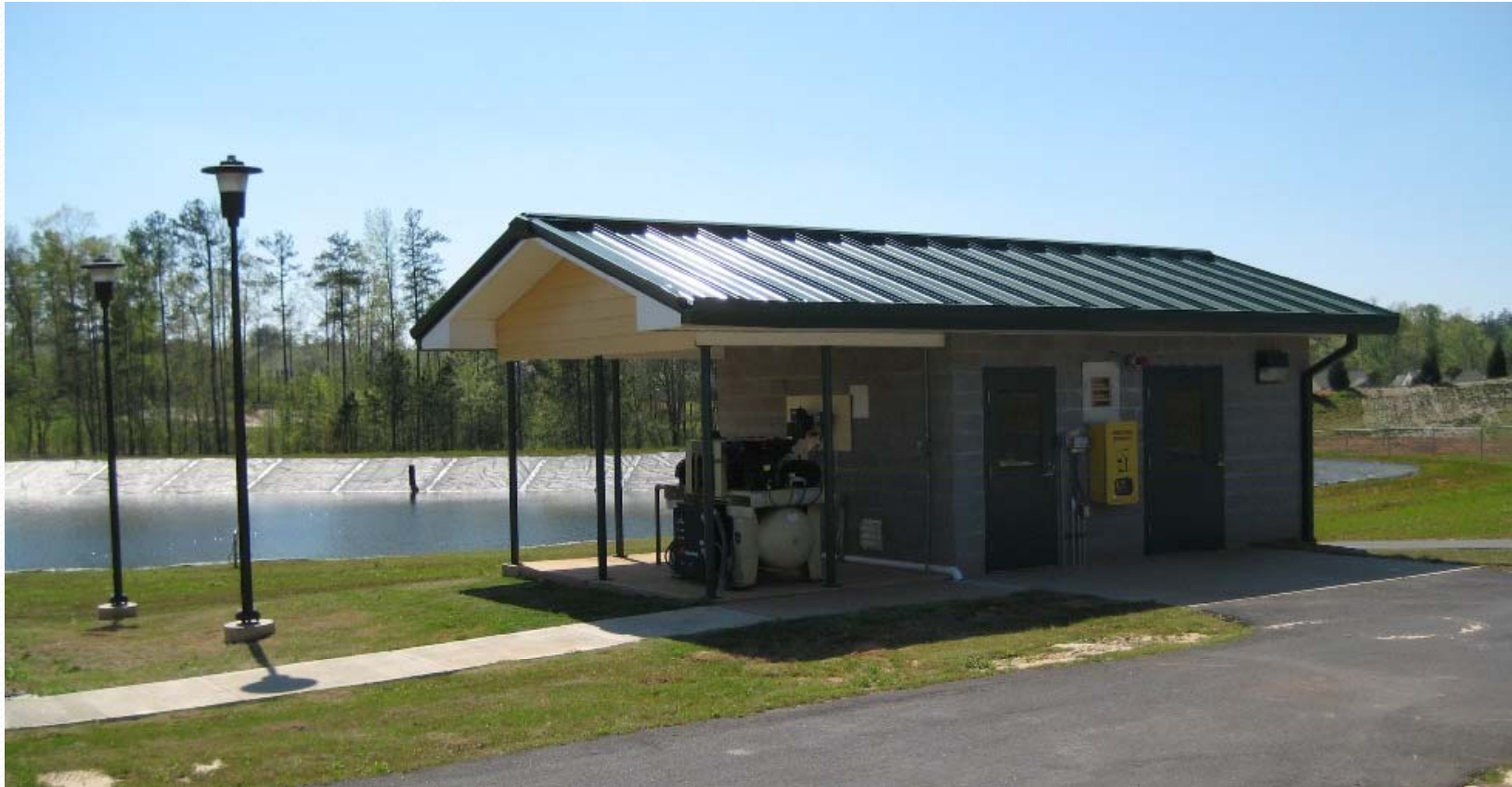
Chemical Building with Air Compressor for Sand Filters